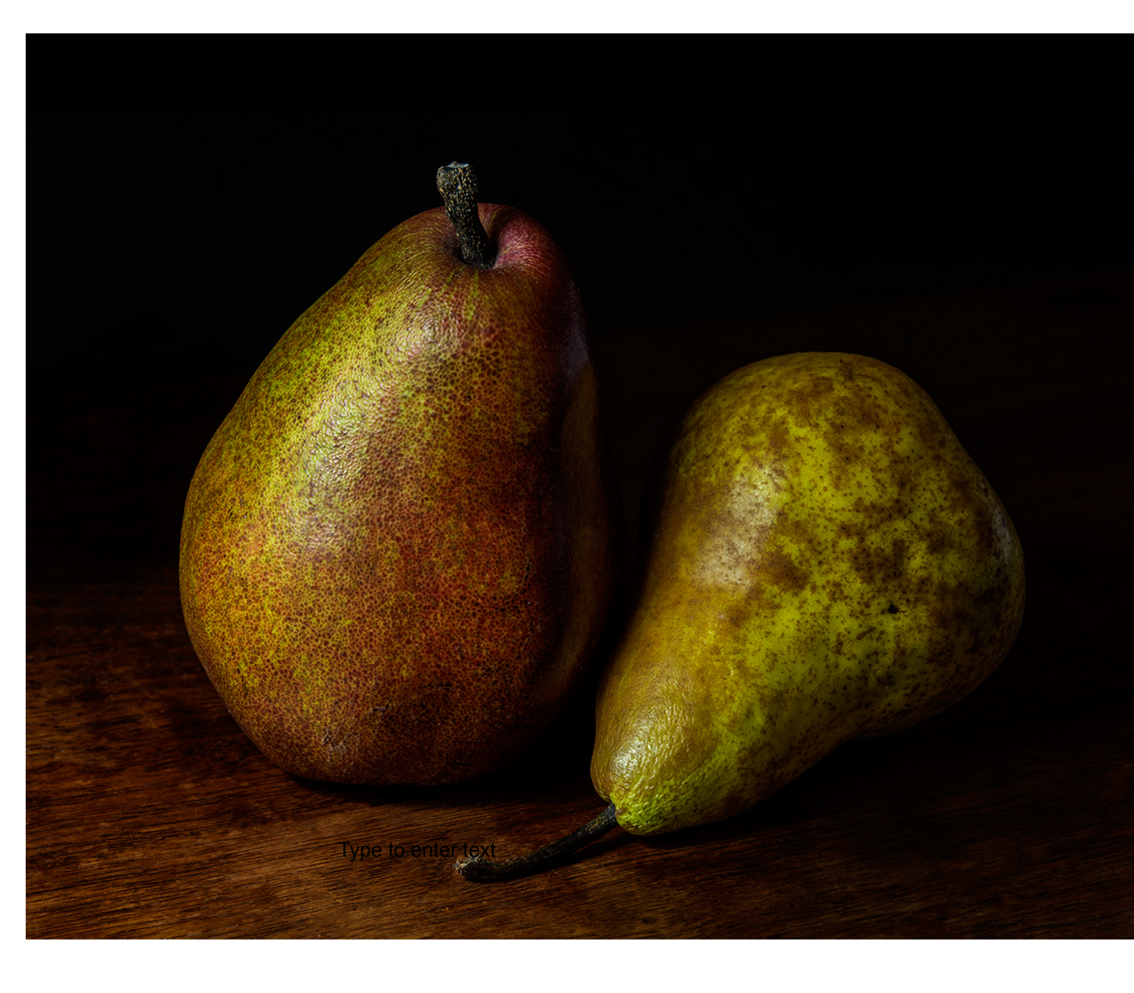
Color Print Photo of the Year by Jim Turner

A Pair of Pears. I spent almost an hour at Safeway picking out these pairs. They were lit by indirect natural light coming through a window. I used a few pieces of white paper to reflect light onto some parts of the pears to make the lighting appear to come more from the side. Shot with a Nikon 60mm f/2.8g at 1/1.6s, f/11, ISO 100.