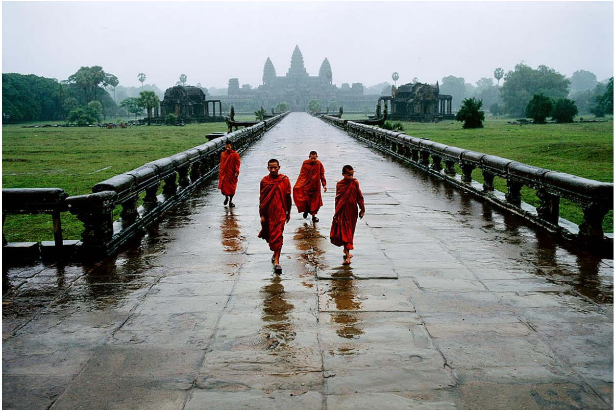
Four monks at Angkor Wat.

So why is this a good image? The monks' faces are indistinct; the sky is featureless; the view is boringly centered.