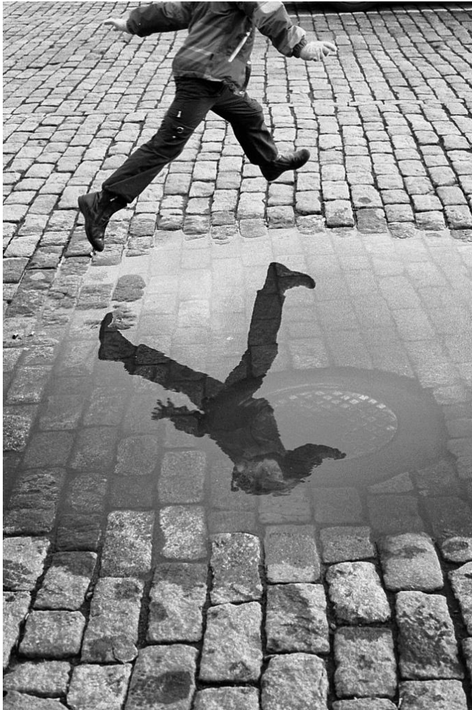
Boy Jumping Over Rain Puddle

Cartier-Bresson had a continuing interest in people jumping over puddles. He shot them both candidly and staged. I love the innovation in this shot to cut off the real boy's head, and to show all of him in the puddle reflection. Could we say that Philippe Halsman (#40, May 2019) took inspiration from this for his Jump book? Sure!