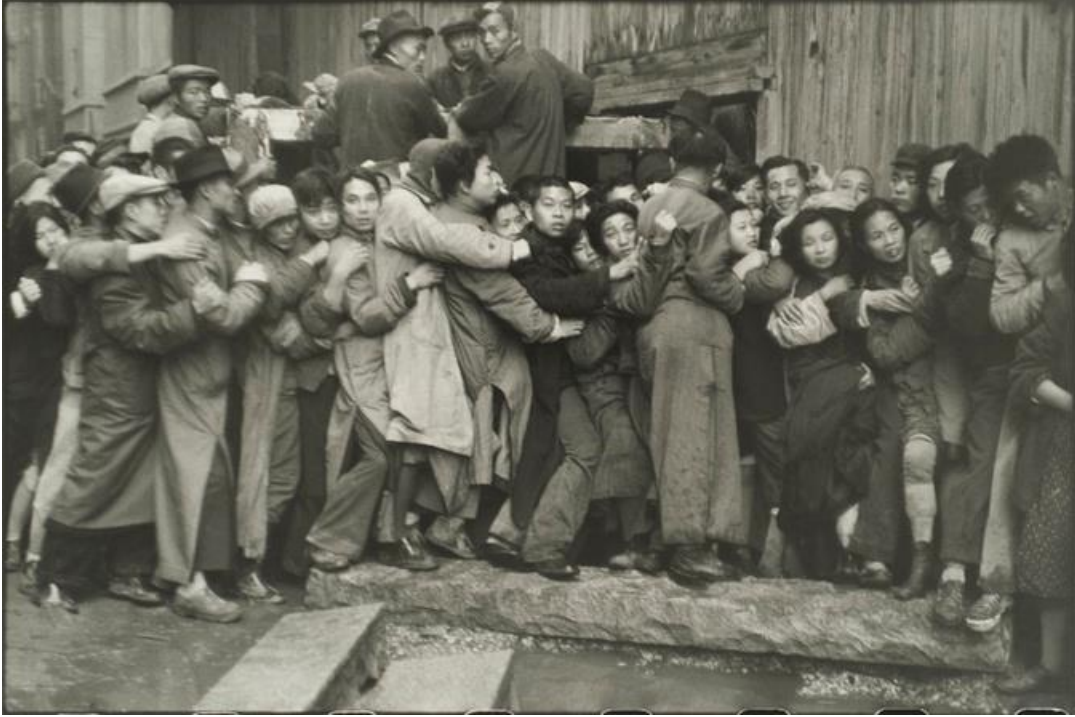
... and here.