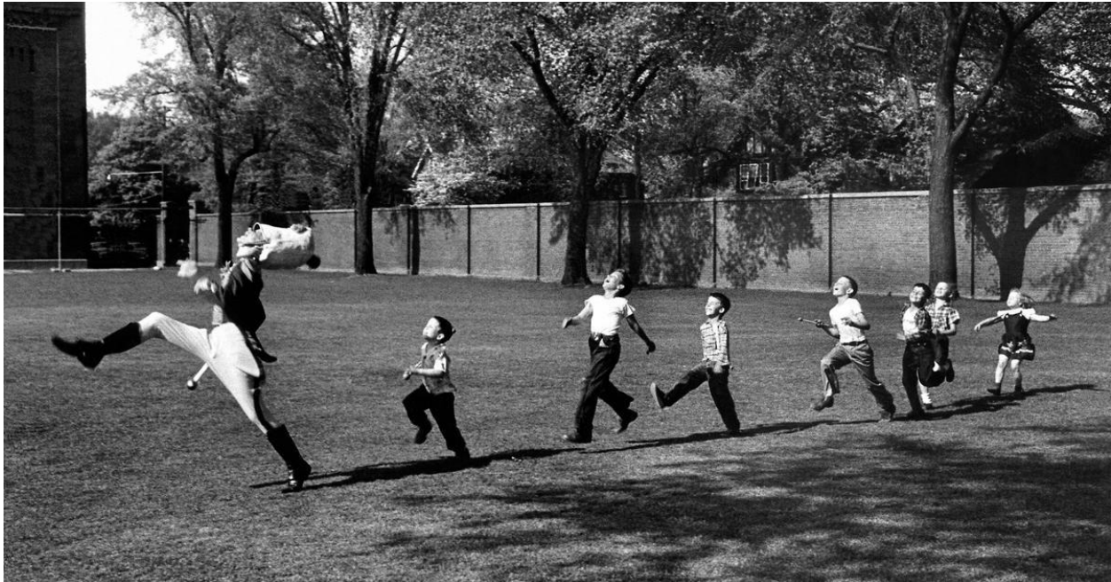
Drum Major and Children, 1951, University of Michigan

The U Mich Drum Major was practicing his high-stepping. This has sometimes been called “the happiest photograph every shot.” It was in the famous “Family of Man” show in 1955 at the Museum of Modern Art in New York City, which was curated by Edward Steichen (#9, Sept. 2013).