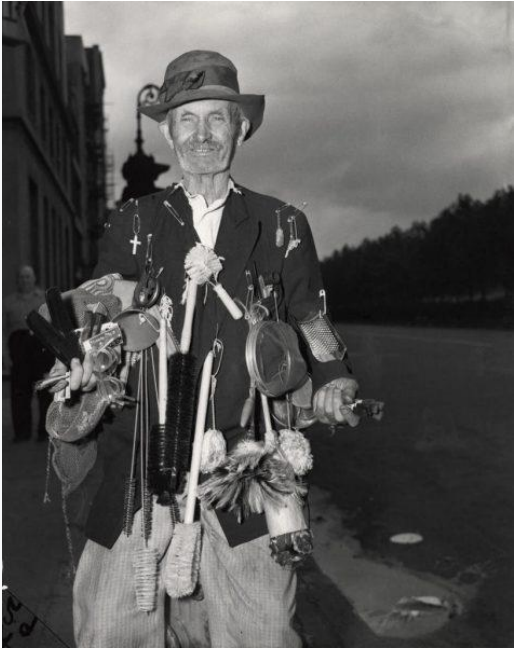
Life in poor neighborhoods