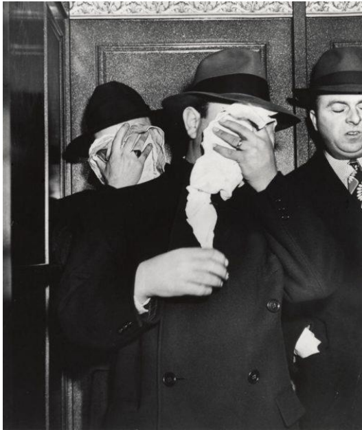
Arrested individuals avoiding the camera

This image appeared on the cover of Weegee's first book, Naked City . Here is the advertising text from the Amazon website selling this book: