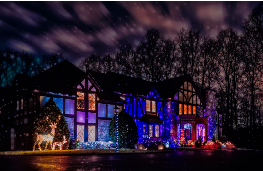
Second Place: “Loni’s House” By Goutam Sen