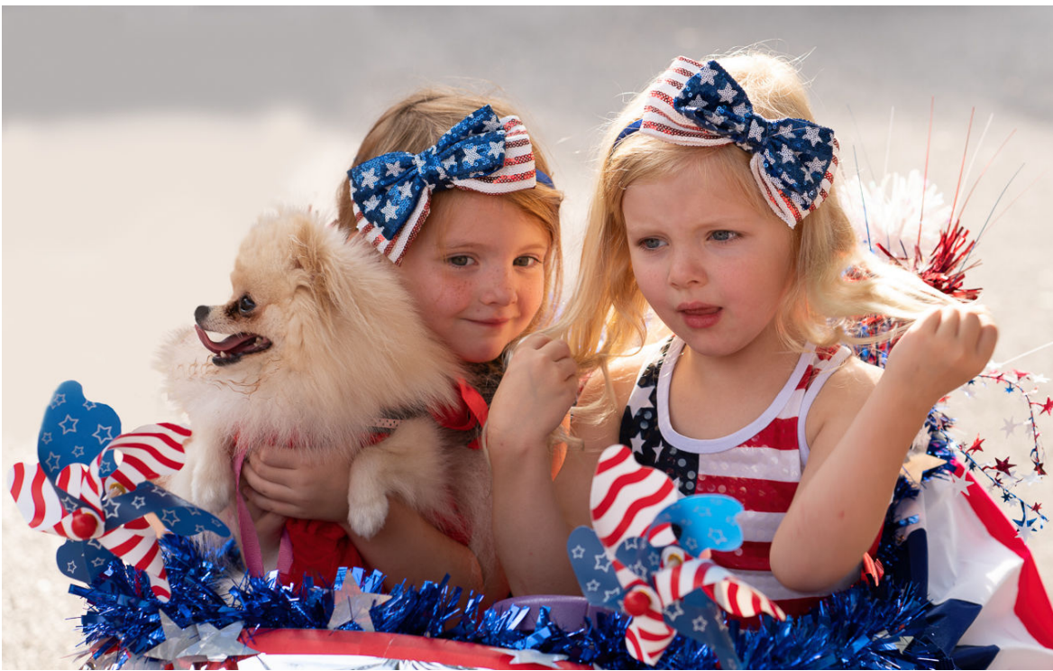
First Place: “The Fourth” By Saul Pleeter