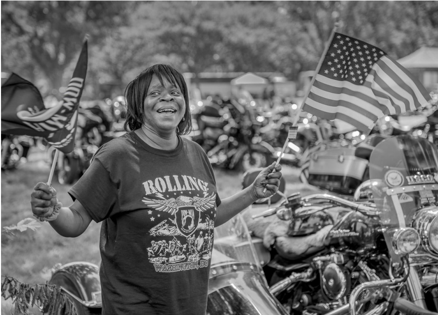
First Place: “Memorial Day” By Saul Pleeter