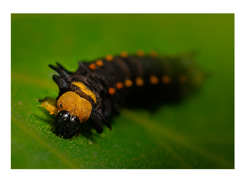
Third Place: "Cat's Eye" By Ann McDermott

I was visiting Brookside Gardens last Spring and thought of taking picture of butterflies. At the entrance of the Butterfly garden, I noticed this caterpillar was crawling on a leaf. Can't resist for a macro shot. Sony a6300, f/4.5, 1/350 sec, ISO 200, 90 mm.