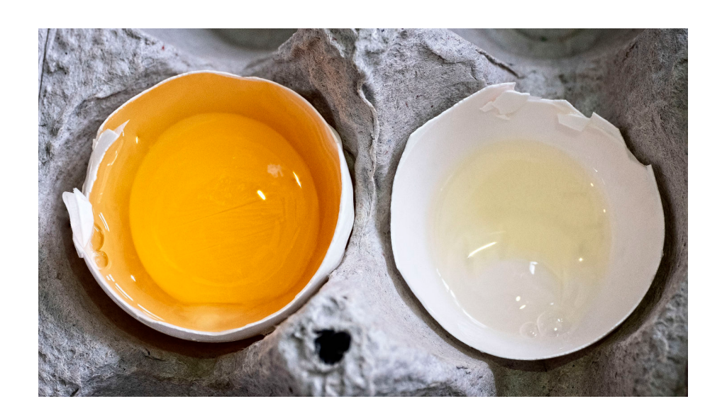
HM: "Incipient Omelette"

I used natural lighting and my Zeiss macro lens to take this photo as well as bracketing with focus to give me focus stacking which I processed in Photoshop. The poor egg didn't survive but no animals were hurt.