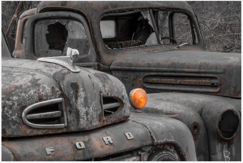
HM: "Ford" by Stan Collyer

These old trucks were found in a junkyard in rural Maryland. I desaturated the image, except for the orange light on the fender. Yes, it's gimmicky, but who cares! Shot with a tripod and a 70-200 mm lens set at 70mm, f/32, 0.3 sec, ISO 200.