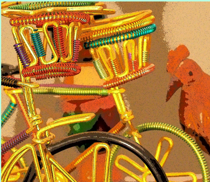
HM Digital Quentin Fisher “Two Bicycles and a Chicken”